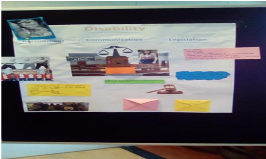
Figure 3. Poster on Disability from the conference.

The research questions have been answered and addressed through the achievement of different students working collaboratively together on a shared project. The students do use PBL to scaffold the learning process, but they do so autonomously and through self-learning and, ultimately, a new pedagogical learning approach occurred. The posters below are some examples of the presentations: