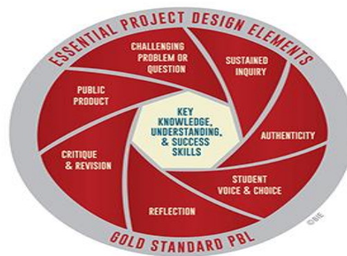
Figure 2. Gold Standard PBL, Buck Institute for Education, 2015.

Problem-based learning requires students to work collaboratively in teams to seek solutions to multi-layered, real-life problems. This approach compels students to consider issues more broadly and acknowledge, perhaps for the first time, alternative views of the topic/case study.