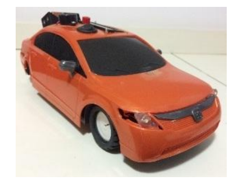
Figure 2. Automated toy car as a robotics learning platform.

Finally, the project development phase focuses on evaluating how much content the students have absorbed, while testing their creativity, originality and developed competencies by means of implementing the learned concepts in a functional product based on what is available on the market or in their daily lives. In an application of the course, for example, a modern car served as a motivational factor to make students excited for what could be built at the end of the course, as well as a basis for introducing several concepts in electronics such as applications of motors, LED (light emitting diode), distance sensors, infrared receivers, LCD (liquid crystal display), and so on. Figure 2 illustrates that learning platform.