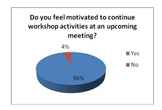
Figure 4. Do you feel motivated to continue workshop activities at an upcoming meeting?

Therefore, at the end of the workshops, we found that the students were able to perform a challenge activity, which corresponded to an update of one of the proposed systems, so, intentionally not being a more complex project, since there would not be enough time in a single workshop. At the level of knowledge, the students, with the help of teachers and tutors, were able to relate the proposed activities to everyday situations experienced by them; at the level of understanding they could interpret the proposed specification, identifying that the challenging activity was only an update of one of the systems proposed and discussed in the course of the actions of the workshop; and, at the application level, they were able to build the hardware and software, from modifications in the codes used in previous activities, necessary to perform the task. With a view to reinforce concepts, the students were encouraged to explain to the teachers and tutors the actions taken to solve the challenge task, which they were able to accomplish at a very satisfactory level.